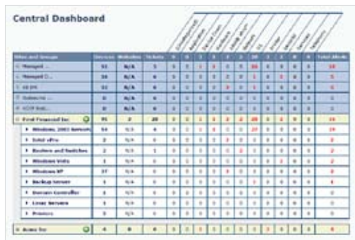
Executive Summary Website Availability Site Performance