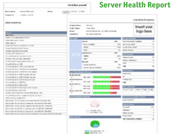
Patch Status Detail Server Health Report