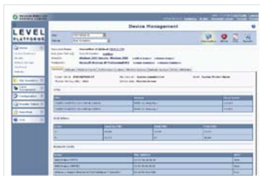
Site Hardware Summary Device Attributes Software Asset Inventory